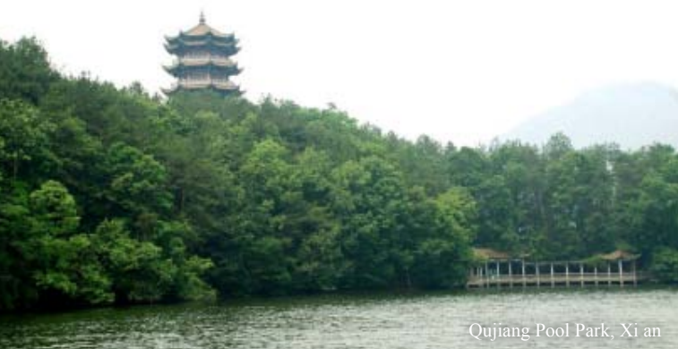
Qujiang Pool Park, Xi'an